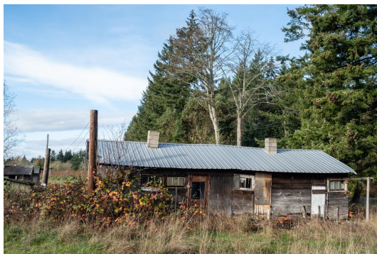
'Variations on a Story', 2020